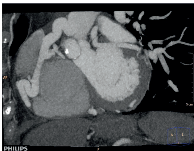
Figure 1. Cardiac computed tomography showing large, tortuous right coronary artery originating from the main pulmonary artery.

In 40% of cases coronary artery anomalies are diagnosed on coronary angiography. 9 TTE, cardiac CT and magnetic resonance imaging are more commonly being used as diagnostic modalities in these coronary anomalies. 9 Treatment of ALCAPA and ARCAPA is indicated to prevent myocardial dysfunction in symptomatic individuals and to reduce the risk of sudden death in asymptomatic cases. 10 Surgical treatment includes ligation of the anomalous artery or more commonly the anomalous coronary artery is repositioned to the aorta. 10 When this is not possible an aortocoronary fistula, the Takeuchi repair, is carried out. Cardiac transplantation is the last resort. 10